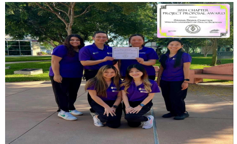
One of the 2024 Summer Project Proposal Winners Gamma Sigma Chapter, Western University