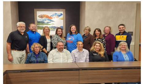
Rho Chi Executive Council