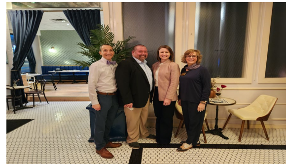
Rho Chi Executive Team