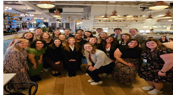
Beta Alpha Chapter, University of South Carolina Rho Chi X PLS Reception at APhA